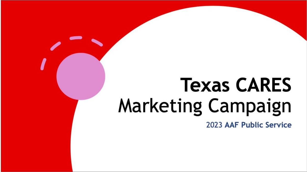
Exhibit B - Campaign Plan Presentation